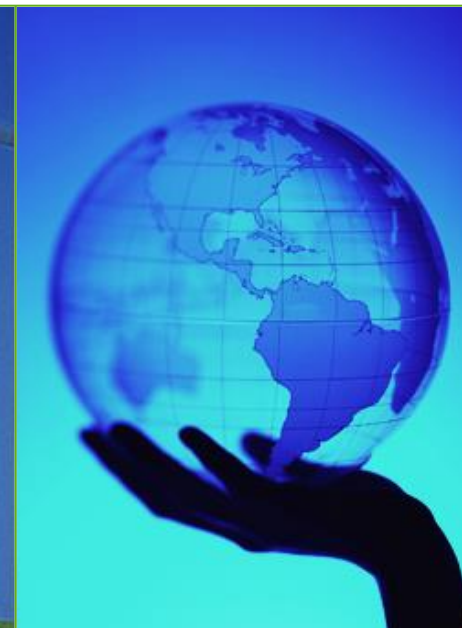
Globalization & developing markets

BASF is dealing with these challenges delivering innovative solutions