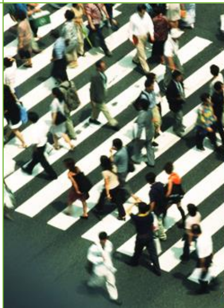
Growing and ageing world population