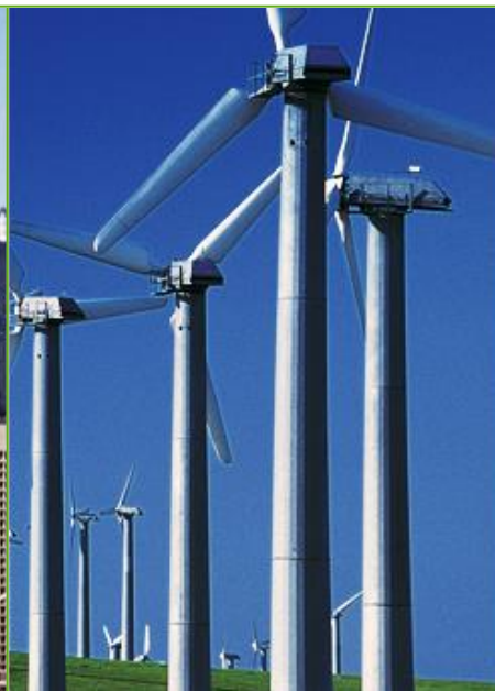
Energy demand & climate protection